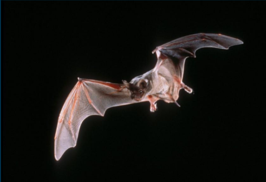
Mexican free-tailed Bat