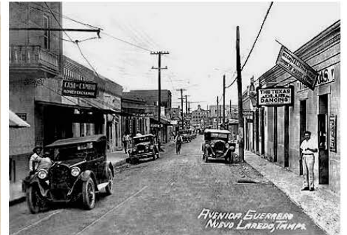
AVENIDA GUERRERO NUEVO LAREDO, TAMPA.