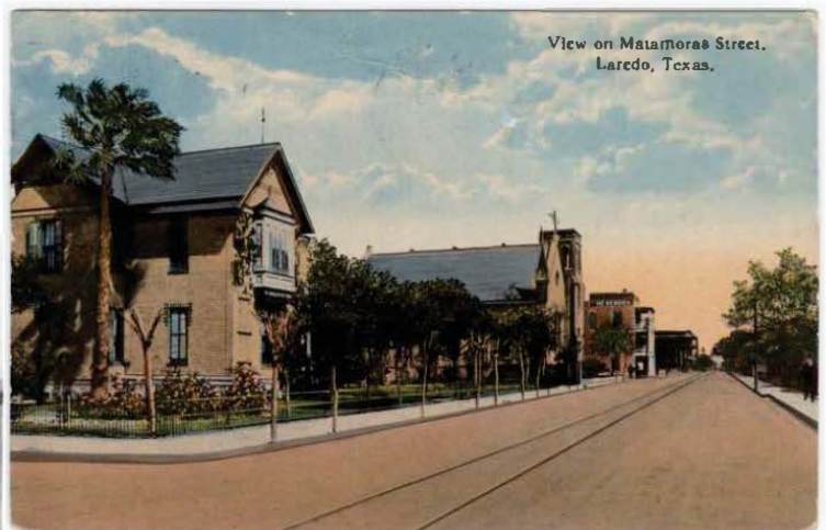
View on Matamoros Street, Laredo, Texas.