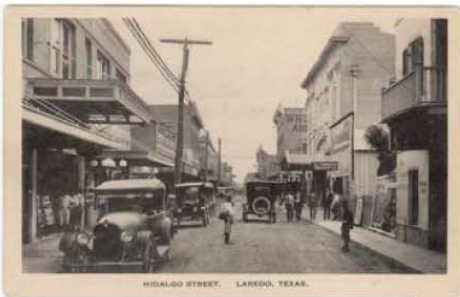
HIDALGO STREET, LAREDO, TEXAS.