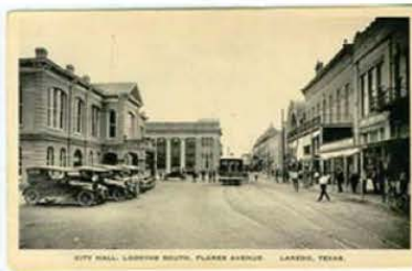
CITY HALL LOCATED NORTH PLAZA AVENUE, LAREDO, TEXAS.