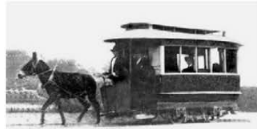
University of Texas Institute of Texan Cultures