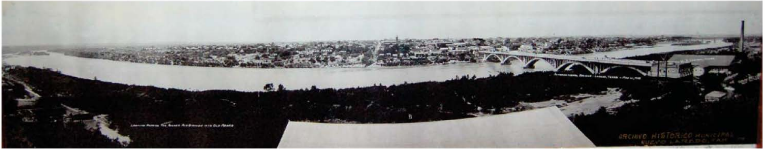
Laredo, Texas, the Grandest City in the World